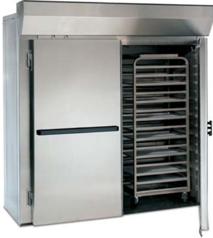
Model LRPR2-40 Shown