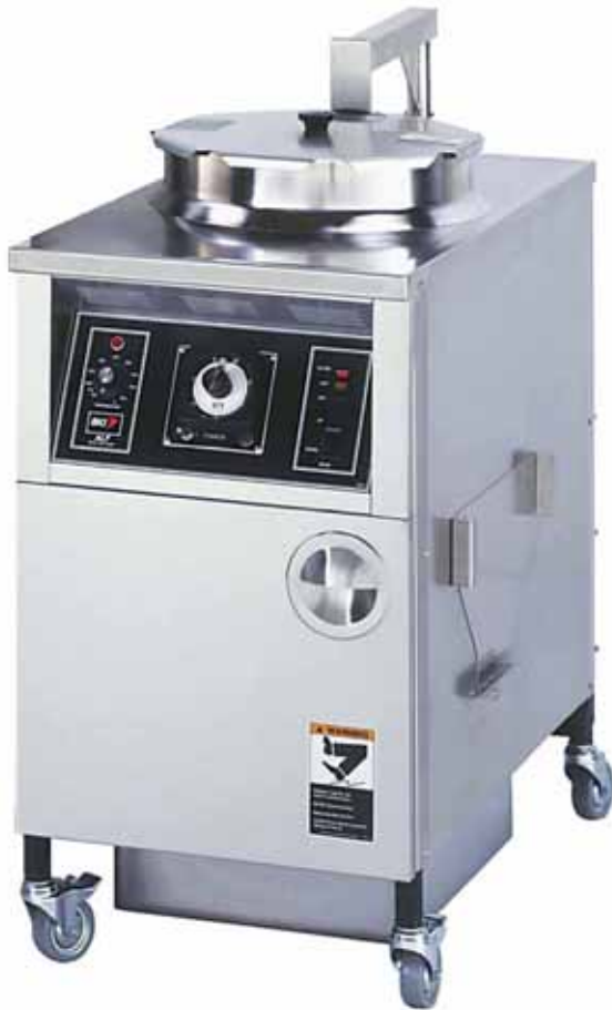
BKI's ALF-F Electric Auto-Lift Fryer shown above with optional Lid Cover and Hanger assembly