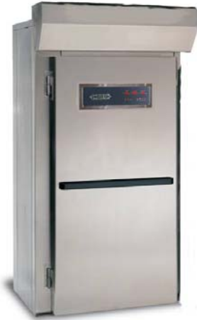
Model LRPR1-40 Shown