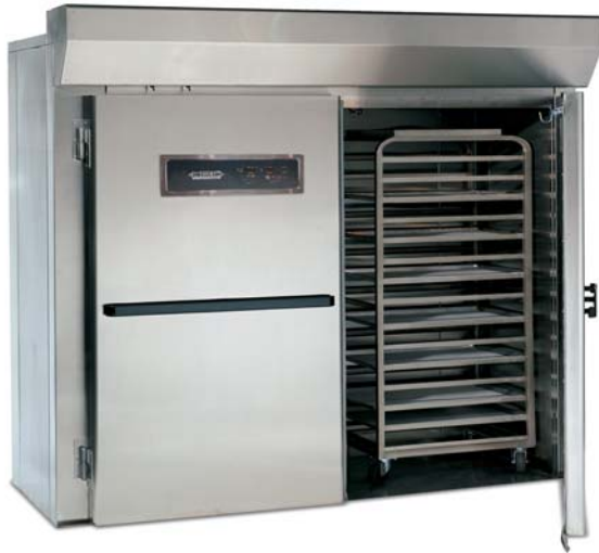
Model LRP3-40 Shown