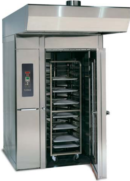
Model LRO-1 Shown (Rack(s) not included)