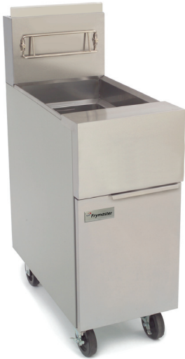
GF40 Shown with optional casters