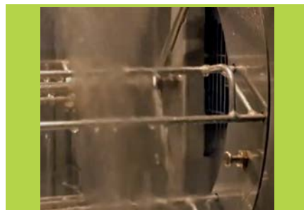
Full automatic cleaning system

Contact us for approved detergents that are suitable for the ACR