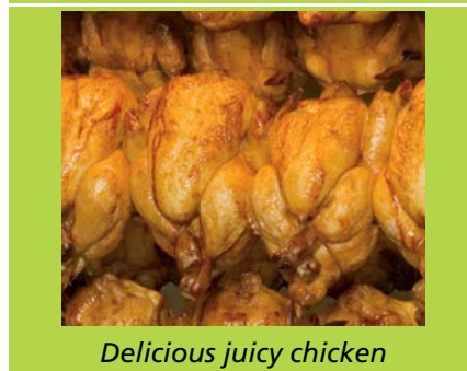
Delicious juicy chicken