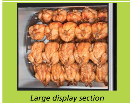
Large display section