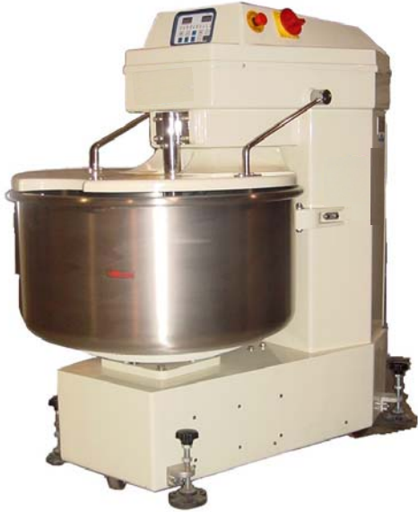
Model FBM-120 shown